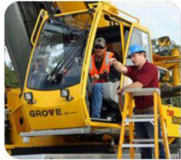
HEAVY CRANE OPT.